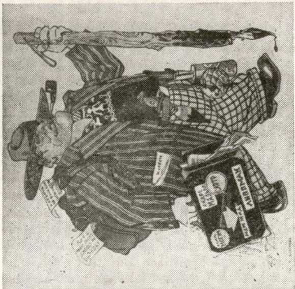
This reproduction is from the original as it appeared in the March 20 issue of Krokodil. The arrow clearly shows the name "Andre Zhid," which is the Russian transliteration for Andre Gide, French writer.